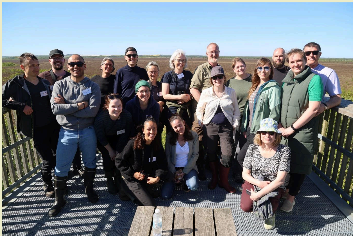
Combining forces to increase the impact of peatland communication - The LIFE PeatCarbon partners together in Denmark during a visit at Lile Villose.